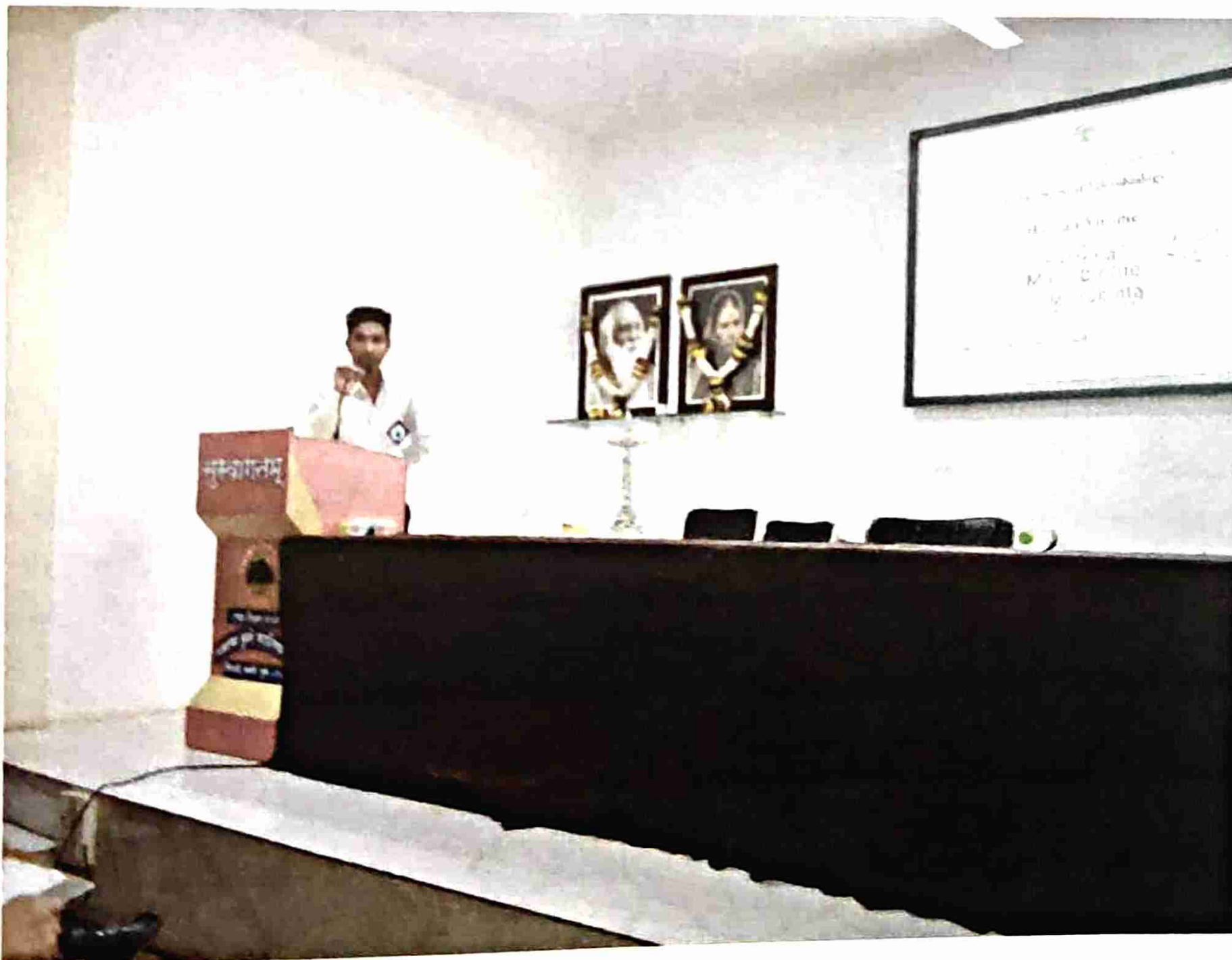
Topic Presentation competition