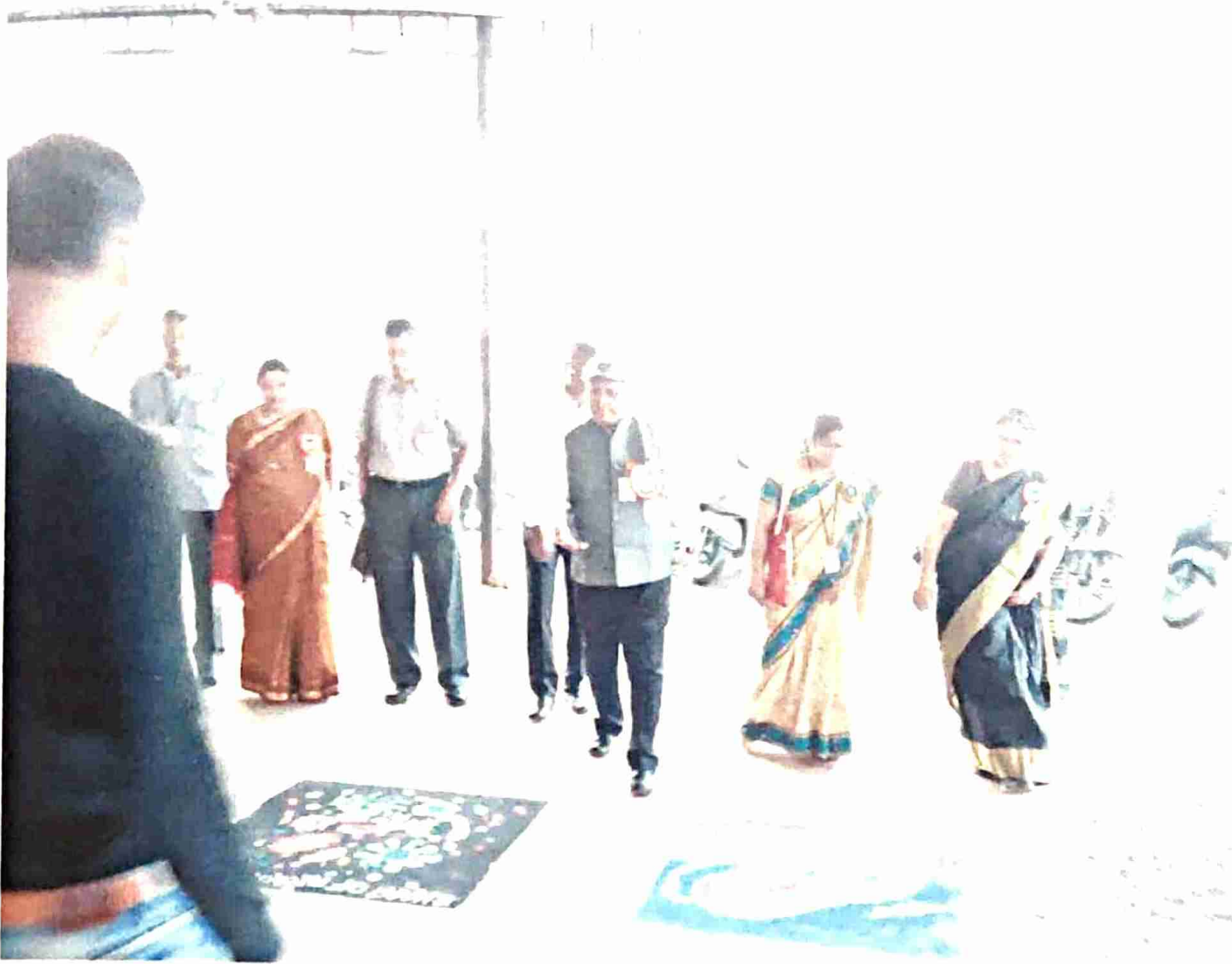
Microbiological Rangoli Competition